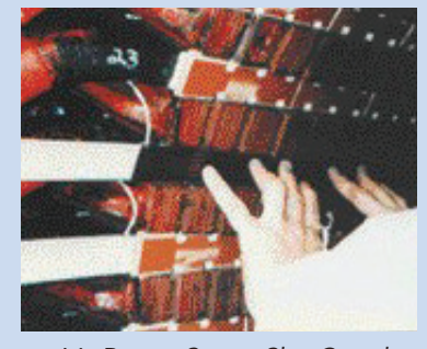
Iris Power Stator Slot Coupler Installation in a stator slot.

The SSCs are connected with micro-coaxial cables to an external termination box. Hydrogen-cooled turbine generators are fitted with gas-tight connectors, or a standard Iris Power hydrogen sealed penetration.