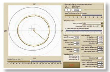
Sample of a polar plot of the data